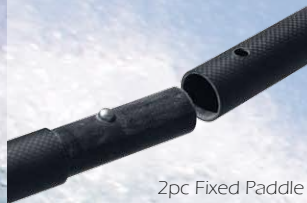
2pc Fixed Paddle